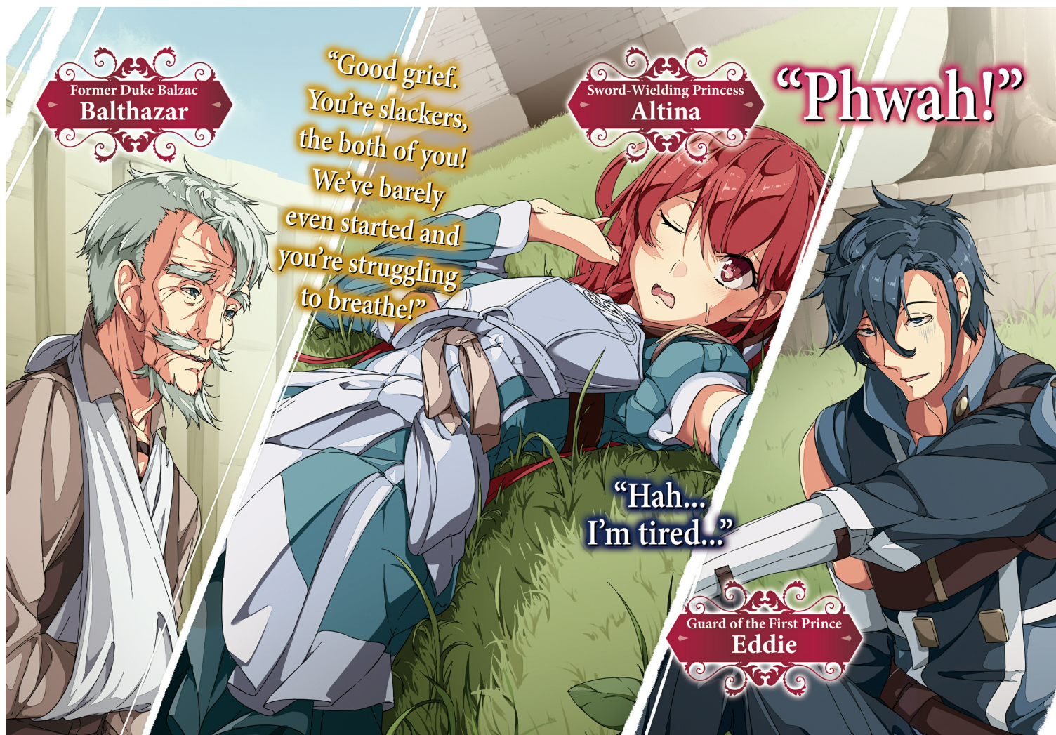
Former Duke Balzac Balthazar

"Good grief. You're slackers, the both of you! We've barely even started and you're struggling to breathe!"